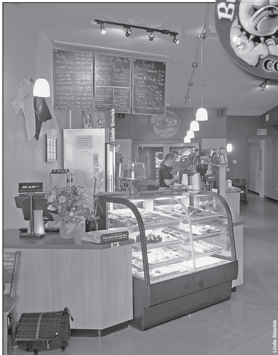
Stop by Butch-n-Nellie's Coffee Co. for coffee or lunch